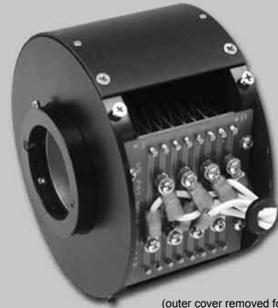
(outer cover removed for view)